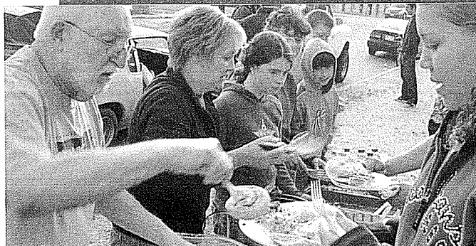
Dry Bones Denver, Member since 2004 (below)

rates because they see first-hand the negative impacts of a credit system that can trap Coloradans in a vicious cycle of debt. Perhaps most importantly, the faith-based sector is working alongside other nonprofits, the business community, and civic leaders to address our state’s fiscal crisis . Faith-based nonprofits view the state budget as a moral document and believe the budget should reflect our core values and priorities as a state.